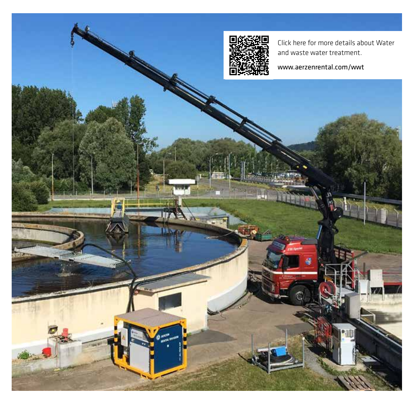
Micro biology was threatened to die. Aerzen rental delivered a complete temporary aeration unit installed within 48 hours.

All the Aerzen Rental machines are suitable for outdoor installation and are equipped with a power and control cabinet. Our rental solutions are the most energy efficient available, because we offer six different pressure settings (compression ratios). We use frequency converters to regulate, which enables to achieve the right pressure and volume flow. By achieving exactly the same as your machines on site, the rental solution has the same energy consumption and do not requires extra power. Furthermore we are able to replace any machine brand and type!