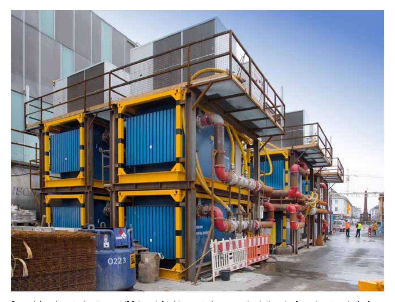
Seasonal air requirement or long-term rental? Or in need of maintenance, testing, or campaigns lasting only a few weeks up to production for a few years? AERZEN RENTAL offers highly economical solutions for almost any requirement.