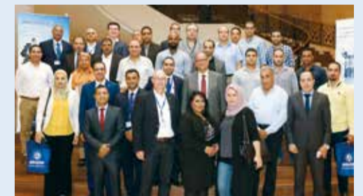
Participants at Aerzen North Africa's first business event.

The establishment of Aerzen North Africa and the move into new premises mark an important step for the AERZEN Group, enabling the company to provide support for many customers and installations in North Africa through its own, local sales and service network.