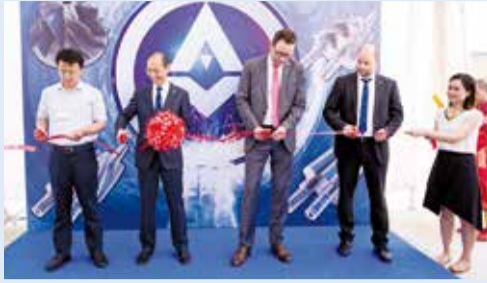
Special moment: symbolically the ribbon for the inauguration of the Aerzen Asia site is cut.