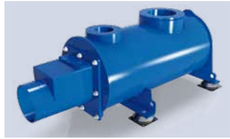
The spark arrester within the AERZEN discharge silencers represents an effective measure to safely prevent the entry of activation energy into the material conveying flow.

While the above measures aim to guarantee the Ex-protection, particularly for pressure pipes, AERZEN considers also for vacuum conveying the ATEX requirements as integral part of a blower solution from one single source. Concerning vacuum conveying the penetration of the material into the blower must be excluded safely. For this, mainly filter inserts are used, creat-