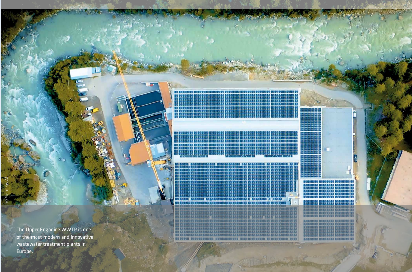
The Upper Engadine WWTP is one of the most modern and innovative wastewater treatment plants in Europe.