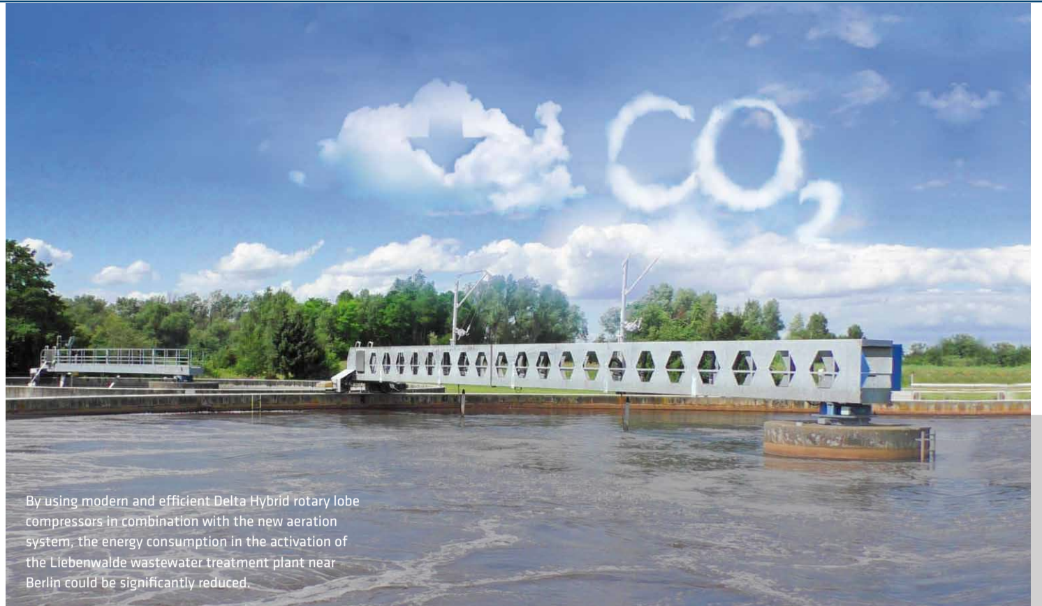
By using modern and efficient Delta Hybrid rotary lobe compressors in combination with the new aeration system, the energy consumption in the activation of the Liebenwalde wastewater treatment plant near Berlin could be significantly reduced.

User report: AERZEN makes the Liebenwalde wastewater treatment plant fit for the future